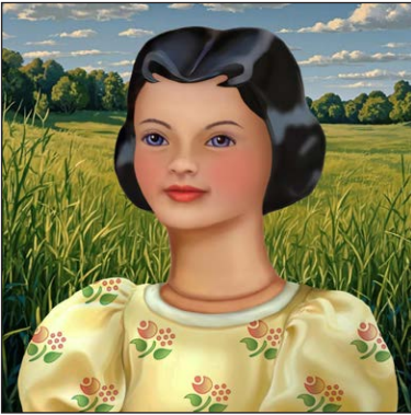
Hitty Preble Hand-carved wooden doll