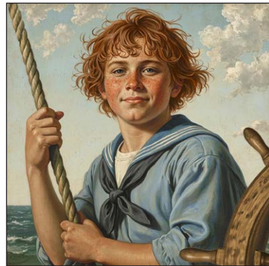
Andy Family helper/cabin boy

The book Hitty: Her First Hundred Years tells the fictional story of a hand-carved wooden doll. For the first two years of her life, Hitty lived with the Preble family of Maine. Author Rachel Field wrote the book while staying in her cottage on Sutton Island, near the Cranberry Isles in Maine. Hitty's Preble family is fictional, but Rachel used her knowledge of the area and its history to add realism. Hitty's life story began in the winter of 1828, exactly one hundred years before Rachel and her friend Dorothy Lathrop, who illustrated the book, purchased the real Hitty doll in an antique shop. Read on to enjoy this timeless children's story in a new, simplified format.