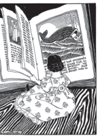
Phibs was a pretty girl of a fine being married

The morning is a very old one. I think and I have it all to myself. The morning is a very old one. I think and I have it all to myself. The morning is a very old one. I think and I have it all to myself.